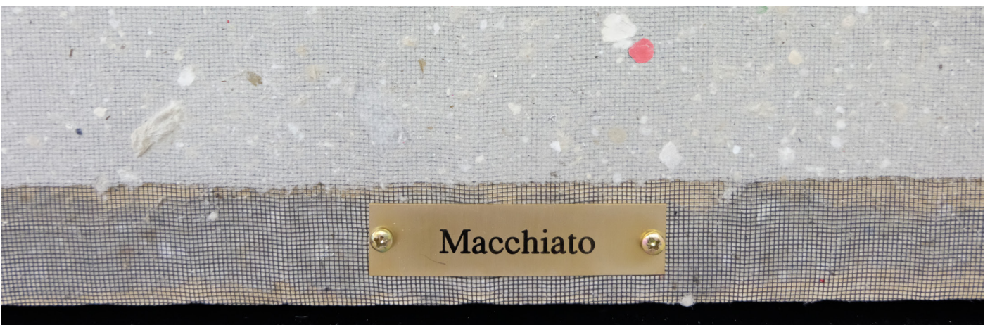
Coffee to go (Macchiato) (detail)

For more information: www.tiestenbosch.com / tiestenbosch@gmail.com / +49 (0) 15756728186 or contact Frank Taal Gallery: www.franktaal.nl / frank@franktaal.nl / +31 (6) 414 00 927