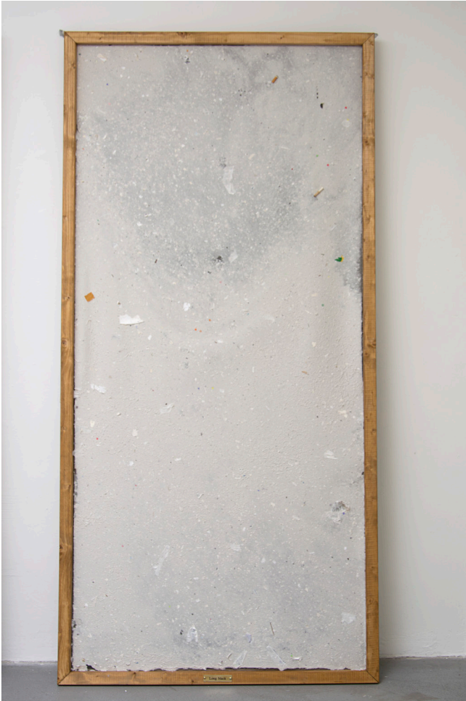
In coffee we trust (detail)