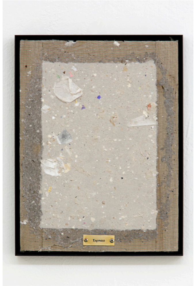
Coffee to go (espresso)