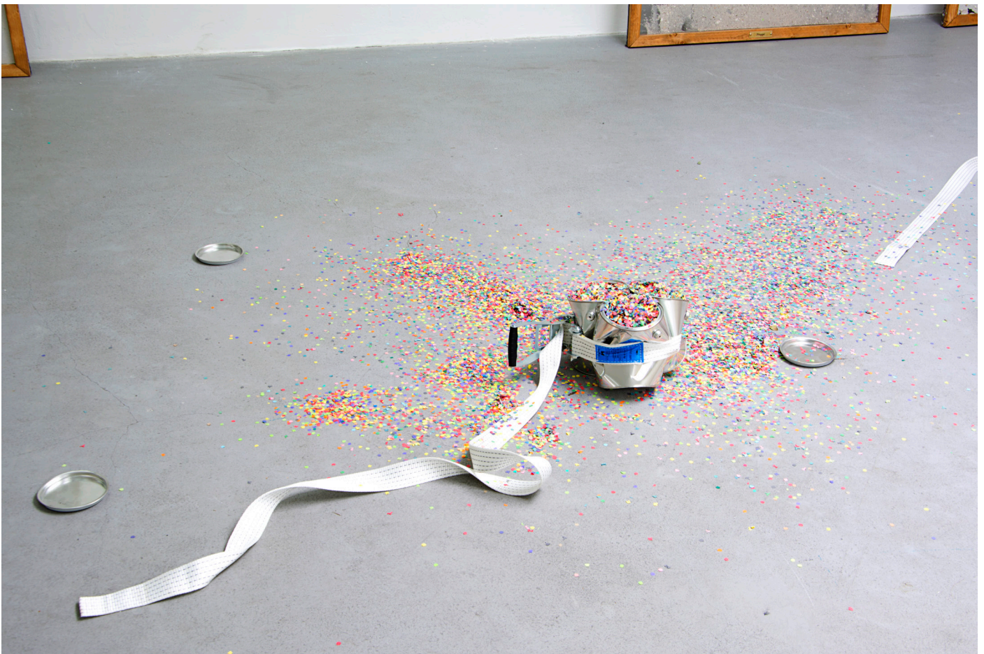
Squeezing out a party

It is over before you know it. The confetti turns into a trail of the action in which the cans were squeezed and gives us a reminder of what happened. The work creates a playful, relaxed atmosphere that captures the transience of a moment.