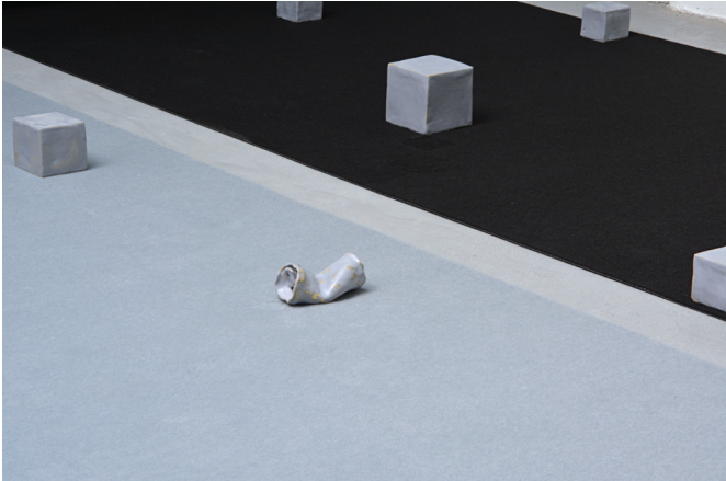
Some other memory (detail)