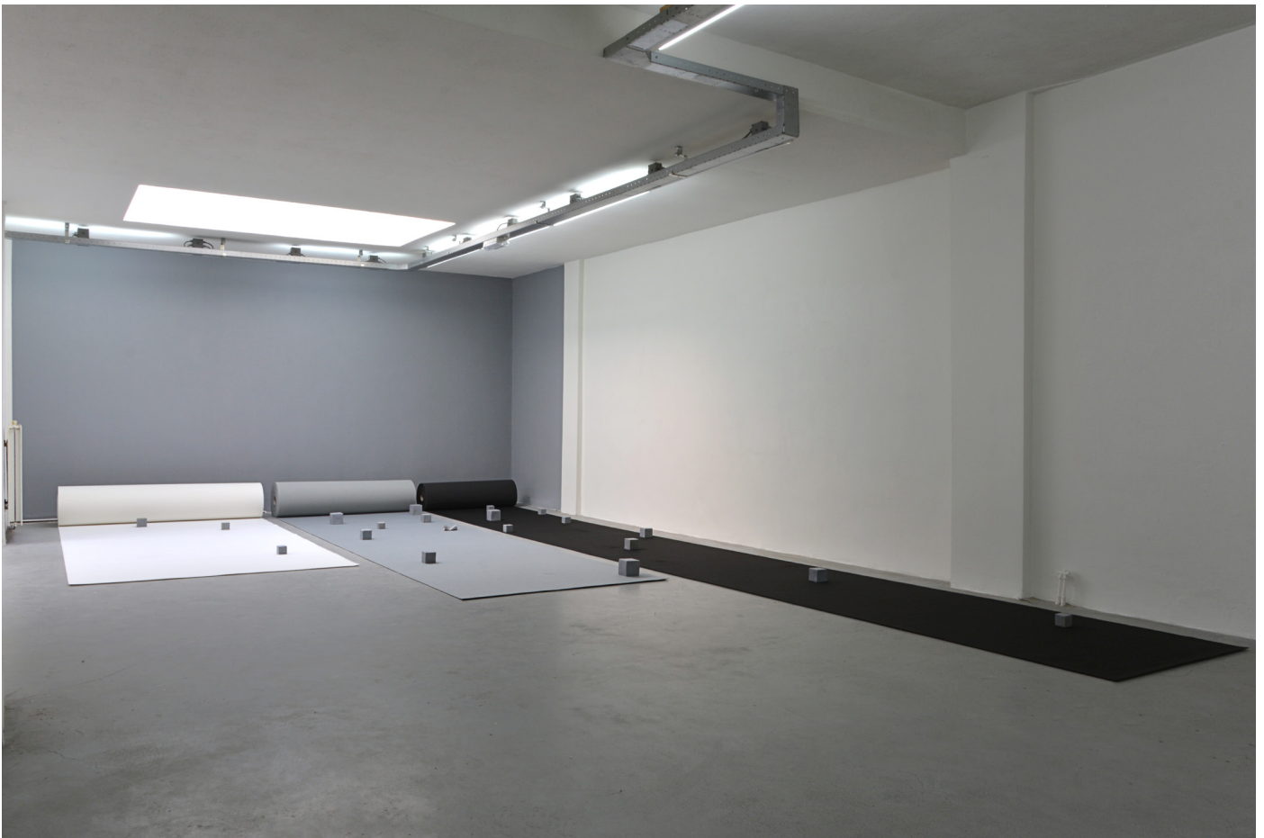
Some other memory

an object that was never originally there. Further on in the exhibition space there are several objects of this kind, made by Ties Ten Bosch and presented with pieces of carpet on pedestals. You can recognize a cigarette pack, a coffee cup and also a coke can. They are primarily things that symbolize unnoticed traces of our daily lives. They have been re-formulated and placed in a new context. Here too, the pieces of carpet have been processed so that a presumed impression of the original object is visible, as if it is inextricably linked to the object.