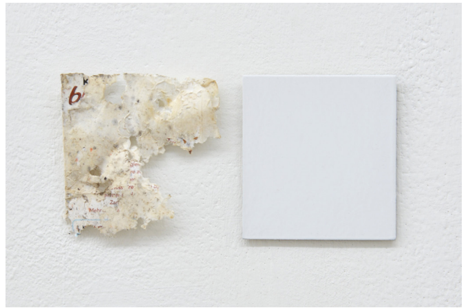
Little remains (ongoing series)