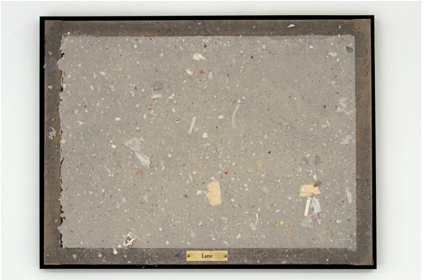
Coffee to go (Latte)