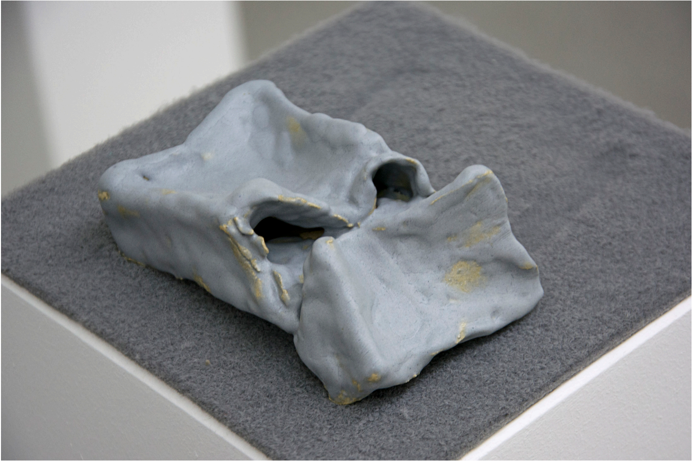
Some other memory (sketches) (detail)