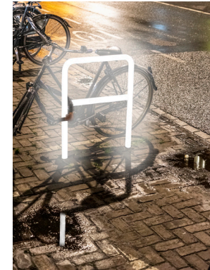
The Bike Lights [concept] 2019 95 x 95 cm, Cated Resin & Steel