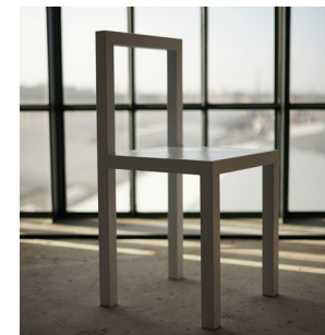
The Material Chair [realised] 2019 40 x 40 cm, Powder Coated Steel