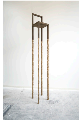
The Urge to Sit Dry [realised] 2018 282 x 40 x 40 cm, European & Smoked Oak

https://www.dearchitect.nl/stedenbouw/artikel/2019/02/boris-maas-urgentie-om-droog-te-zitten-101206154