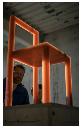
The Material Chair [realised] 2019 40 x 40 cm, Casted Resin